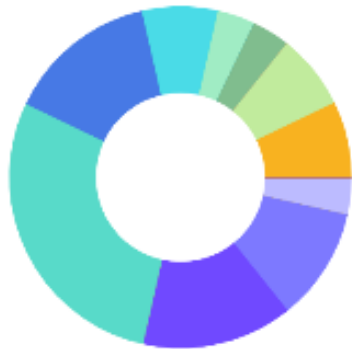
# of Referrals by NVCOG Municipality